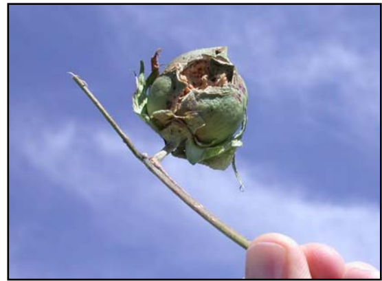
Figure 7. Hail Damaged Boll.

One should generally categorize bolls with badly damaged locks (due to hail stone impact) into the "doomed pile" as these may not exert and properly open (Figure 7).