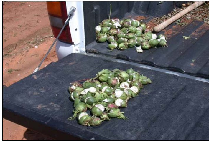
Figure 2. Boll Sample from Hail Damaged Field.

It is suggested that producers sample the affected field in several areas. Cut whole plants from a few row feet (keep track of how many row-ft) and pull all bolls from the plants. Then use a very sharp knife or razor box cutter (BE CAREFUL - one might want to wear a thick leather glove on the hand holding the bolls) and start cutting bolls. Perform a cross-section slice through the center of each boll. Start out with a single pile and begin making judgments on boll maturity (Figure 2). We are looking for three distinctly different boll maturity classes.