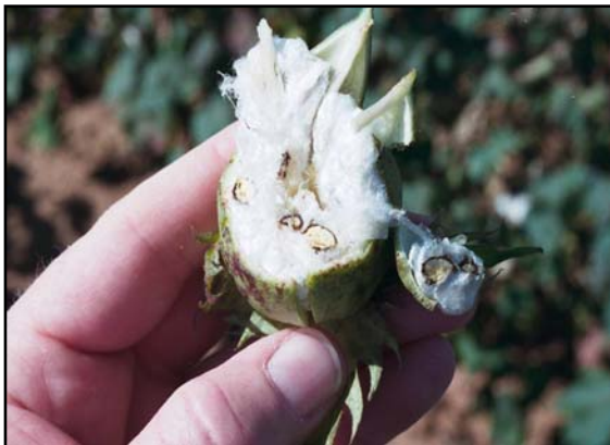
Figure 6. Mature Boll.

Take the remaining bolls with seeds that show excellent cotyledon development and seed coat color from tan to dark brown and put them into another pile (these are difficult to cut with a sharp knife and are nearly mature or mature bolls, Figure 6).