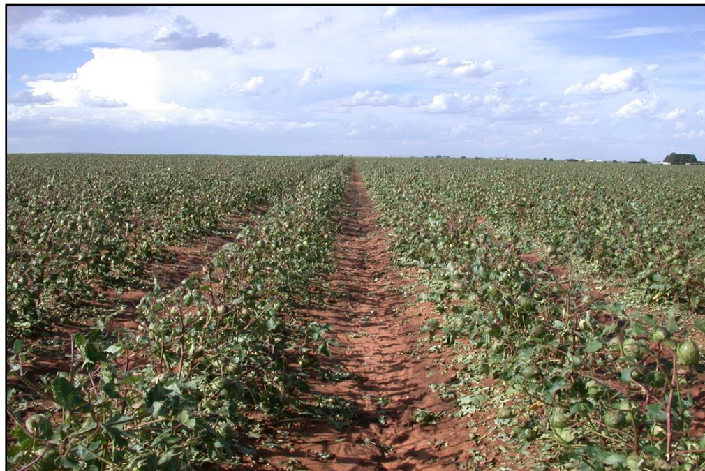
Figure 1. Late Season Hail Damaged Field

Late-season severe weather can result in significant hail damage to immature cotton fields (Figure 1). Because of this, questions arise concerning the use of harvest aid products on these fields. This is a very difficult decision. When hail damage occurs, depending upon the level of defoliation and boll maturity, low micronaire should be expected. Low gin turnout and bark contamination are also very likely due to increased foreign material (sticks, stems) in stripper harvested cotton.