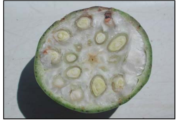
Figure 5. Well Developed Cotyledons and Seed Coats Darkening.

Then, take all the bolls that have well-formed cotyledons and darkening seed coats and put them into another pile (these can be termed the "questionable" bolls, Figure 5).