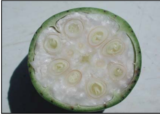
Figure 4. Cotyledons Still Not Fully Developed (Jelly Present).